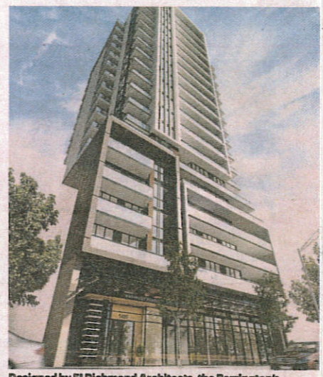
Designed by El Richmond Architects, the Barrington's 18-storey exterior will frame stylish interiors by Tanner Hill and Associates.