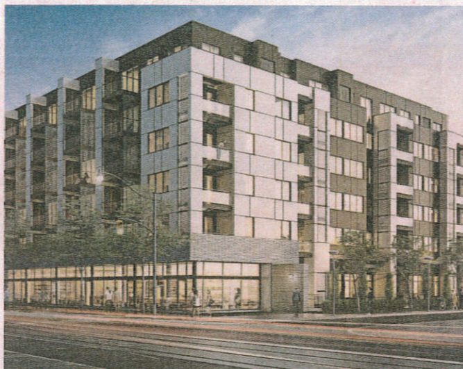
Scoop condominiums, a new midrise of six storeys and 72 units, is located at the western end of St. Clair Avenue West.

Designed by El Richmond Architects, the Barrington's 18-storey tower exterior will frame stylish interiors by Tanner Hill and Associates. The address boasts a walk score of 98 and a bike score of 88. Amenities will include a sophisticated lobby featuring an executive concierge service, a catering kitchen and dining area, and a terrace with